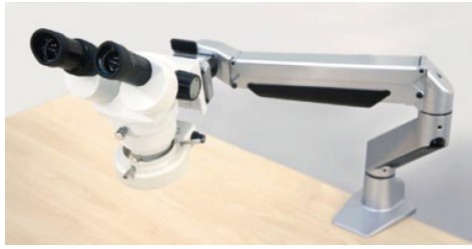
ASM-112BS Stereo Microscope & LED Ring Light