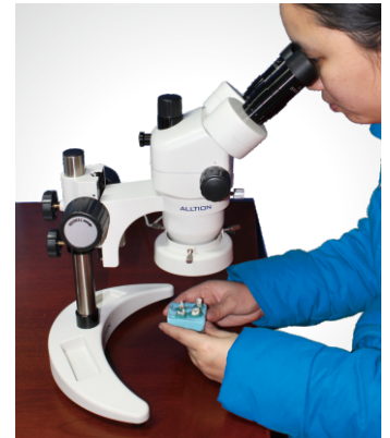
0745:7X-45X stereo zoom microscope