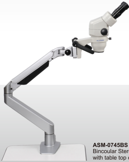
ASM-0745BS Bincocular Stereo Zoom Microscope with table top clamp & handgrips

Professional ergonomic design just for you, all dental technicians