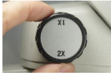
112: 10X/20X two-step magnification