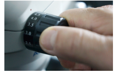
0745: 7X-45X stereo zoom