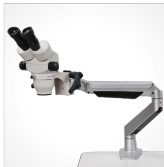
BS: Bincocular, Pantograph arm with table top clamp with handgrips