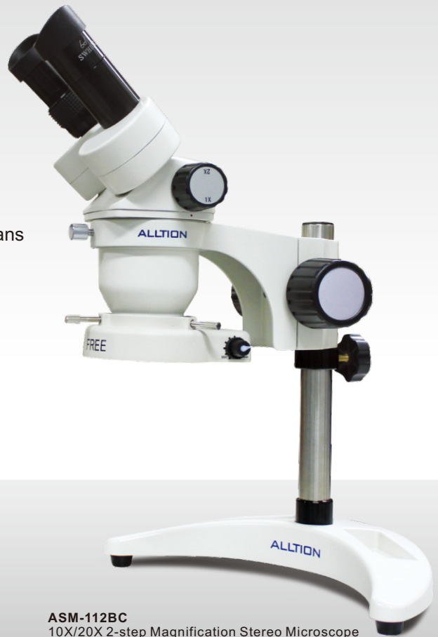
ASM-112BC 10X/20X 2-step Magnification Stereo Microscope