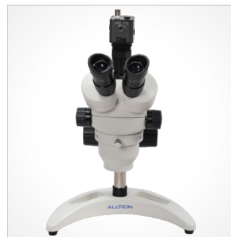
TC: Trinocular, C-shape base