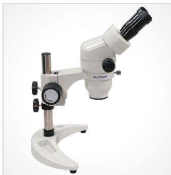
BC: Bincocular, C-shape base