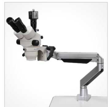
TS: Trinocular, Pantograph arm with table top clamp with handgrips